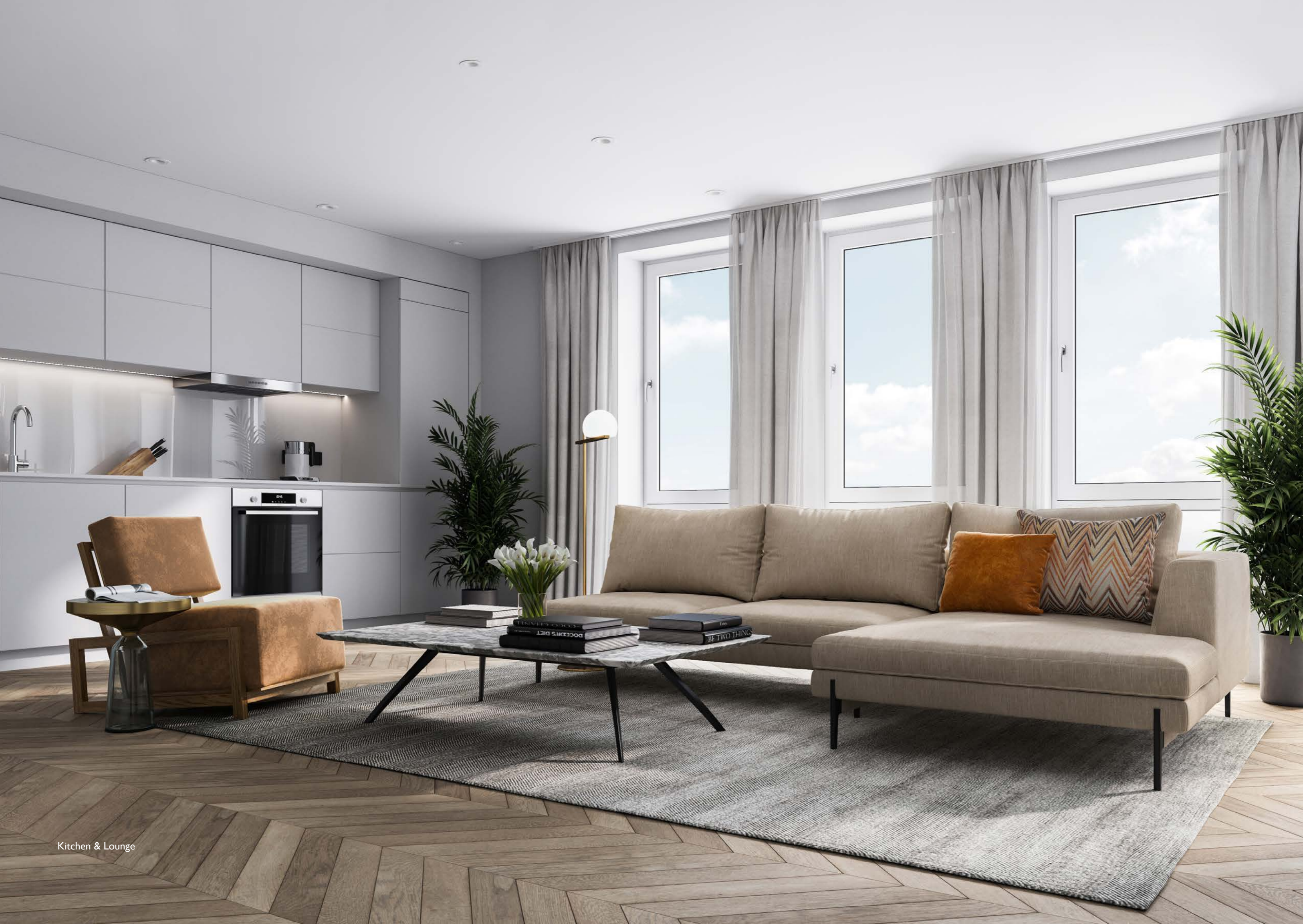
Kitchen & Lounge