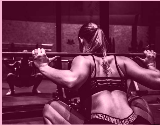
THE GYM Fully equipped, low-cost gym 7 min walk