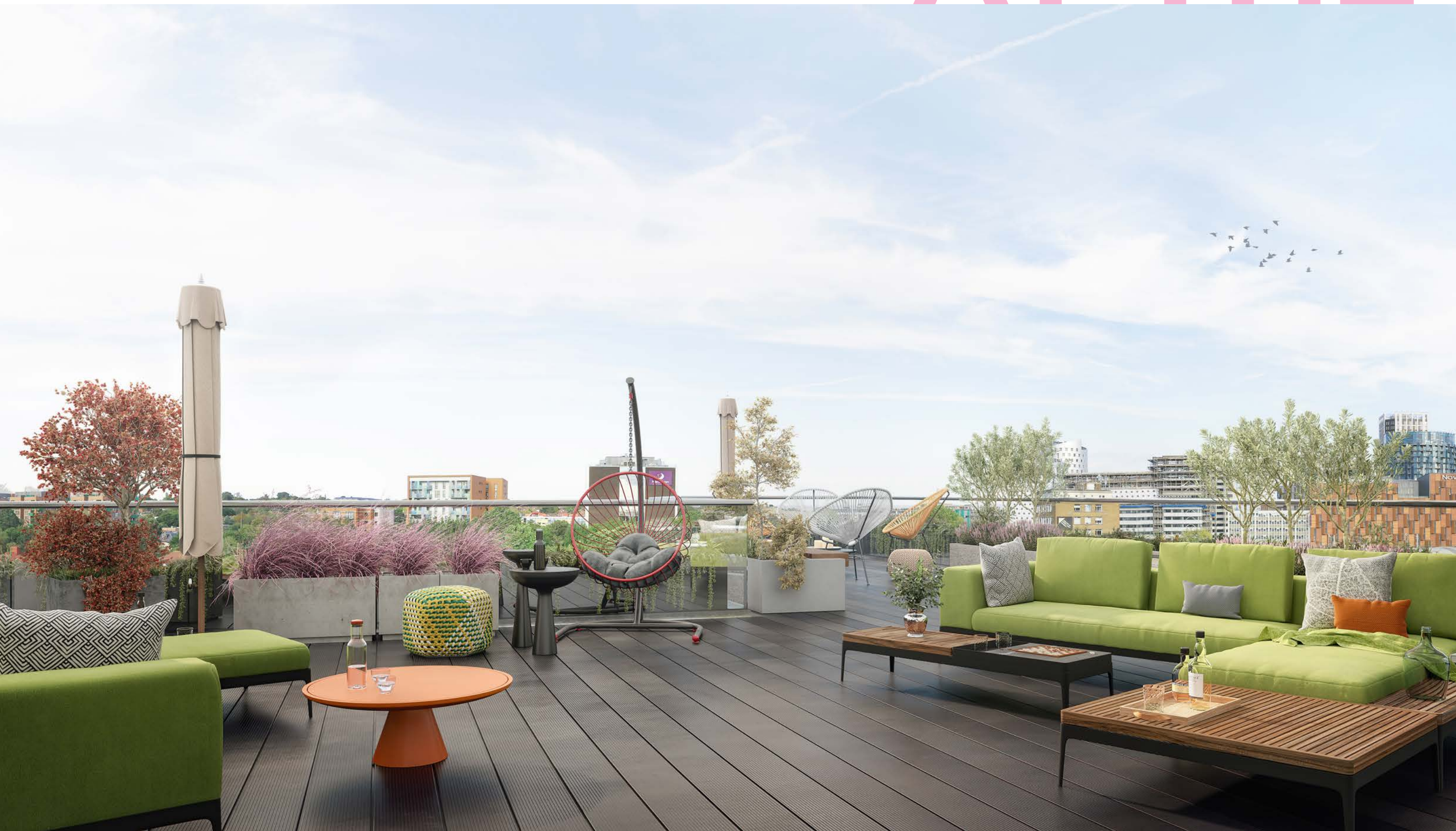
At the top of Empire One sits the communal roof terrace, offering perspectives of London's classic skyline. Shielded by a glazed balustrade that extends around the rooftop's perimeter, the terrace is a welcoming and relaxing environment, perfect for enjoying long summer evenings with friends or a morning meditation.

AT THE T N M R J V S K SHIELDED GLAZED B