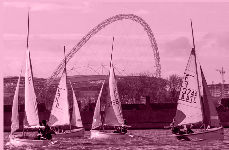
WELSH HARP Learn to sail, wind surf or canoe with one of the many clubs on the Harp 28 min walk