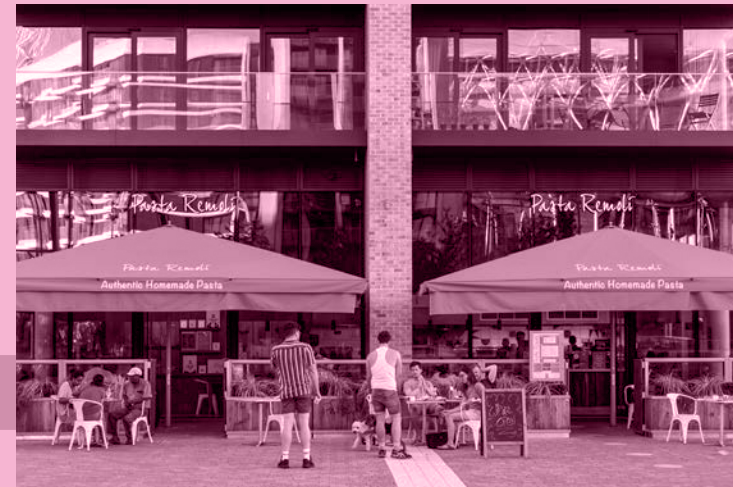
PASTA REMOLI Authentic Handmade Pasta 5 min walk