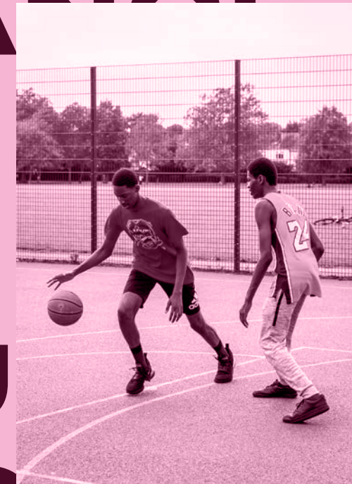
KING EDWARD VII PARK 13 min walk