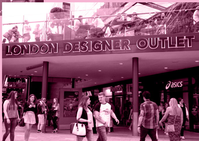
LONDON DESIGNER OUTLET A world-class destination for designer shopping, boutique eating and drinking including names such as Calvin Klein, Nike, Converse, Adidas, Guess, Kurt Geiger, PUMA, Lindt, GAP and Superdry 9 min walk